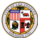
MAYOR ERIC GARCETTI